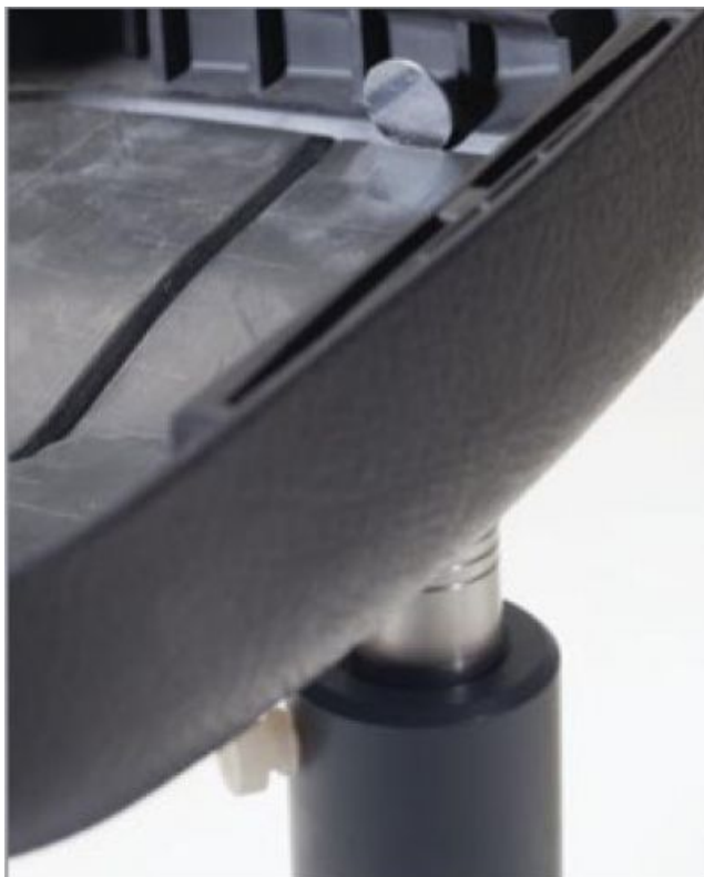
Figure 2. Probe placement on the outside of an air bag cover.