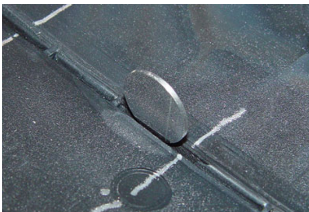
Figure 3. Target disk placement inside a tear seam.