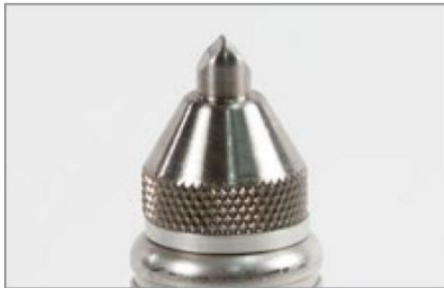
Figure 1. Close-up of the 86PR21-CWC probe tip.

The probes used for this test have a narrow, pointed tip that is designed to fit into tear seams of either geometry (see Figure 1). The probe is normally used with one of two special target disks. The 80TD1 sharp-edged target disk (3/16 in. or 4.8 mm diameter) is designed to fit into V-shaped seams, and the 80TD2 square-edged target disk (1/2 in. or 12.7 mm) is designed for flat seams. Probes may also be used with the standard 1/16 in. (1.6 mm) diameter target ball, although ball targets are normally not recommended for tear seam measurements.